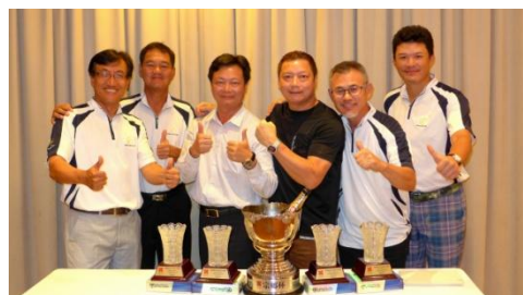
九龍會會長與秘書跟球隊合照 (2)